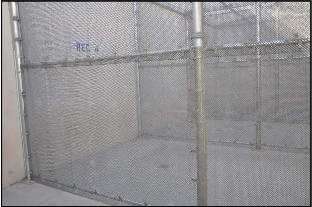
Concrete, Fenced-In Recreation Area for Disciplinary Segregation Unit (Adelanto West Facility)

The specter of being placed in solitary confinement hangs over all Adelanto detainees. GEO Group's Adelanto ICE Processing Center Supplemental Detainee Handbook lists more than 50 offenses that can result in a detainee's placement in disciplinary segregation, including minor infractions like "refusal to clean assigned living area," "refusing to obey a staff member officer's order," "being in an unauthorized area," or "failure to stand [during] count." (GEO Group's policy appears to track the applicable 2011 ICE Performance-Based National Detention Standards, which explicitly permit disciplinary segregation for these behaviors. 51 )