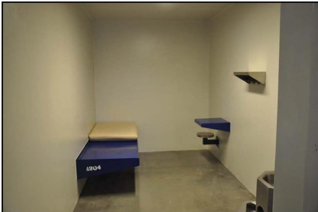
Men's Administrative Segregation Unit Cell (Adelanto West Facility)