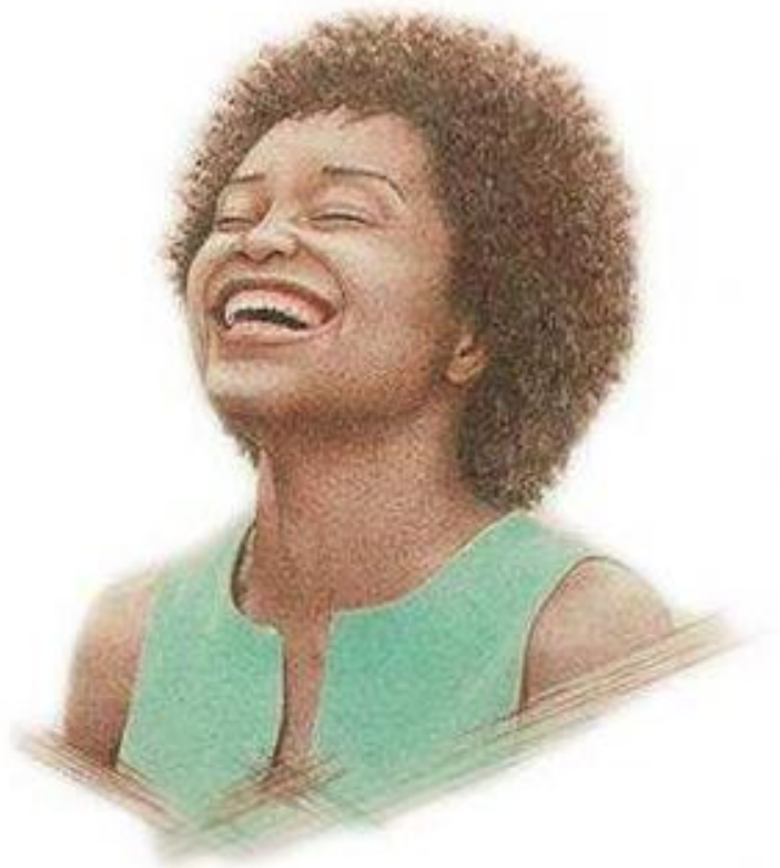
Illustration by an Artist in Immigration Detention Adelanto Detention Center, 2018