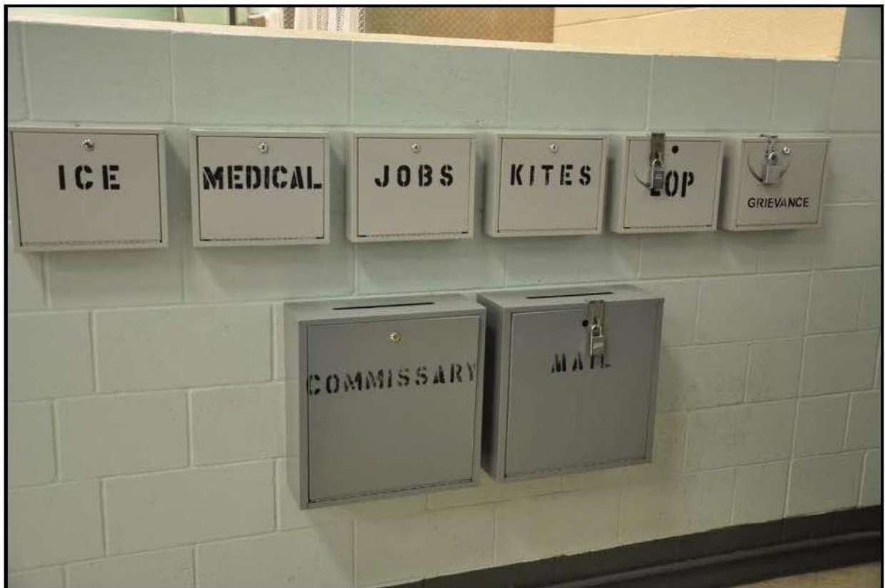
Form Submission Boxes for Detainees (Adelanto East Facility)

Staff acknowledged that their practice is in fact to return grievance forms with disability accommodation-related requests to the detainee without investigation or action, directing the detainee to submit a medical request form instead. This practice is inconsistent with the ICE National Detention standards requirement that “detainees shall be permitted to raise concerns about disability-related accommodations and/or the accommodations process through the grievance system. ” 85