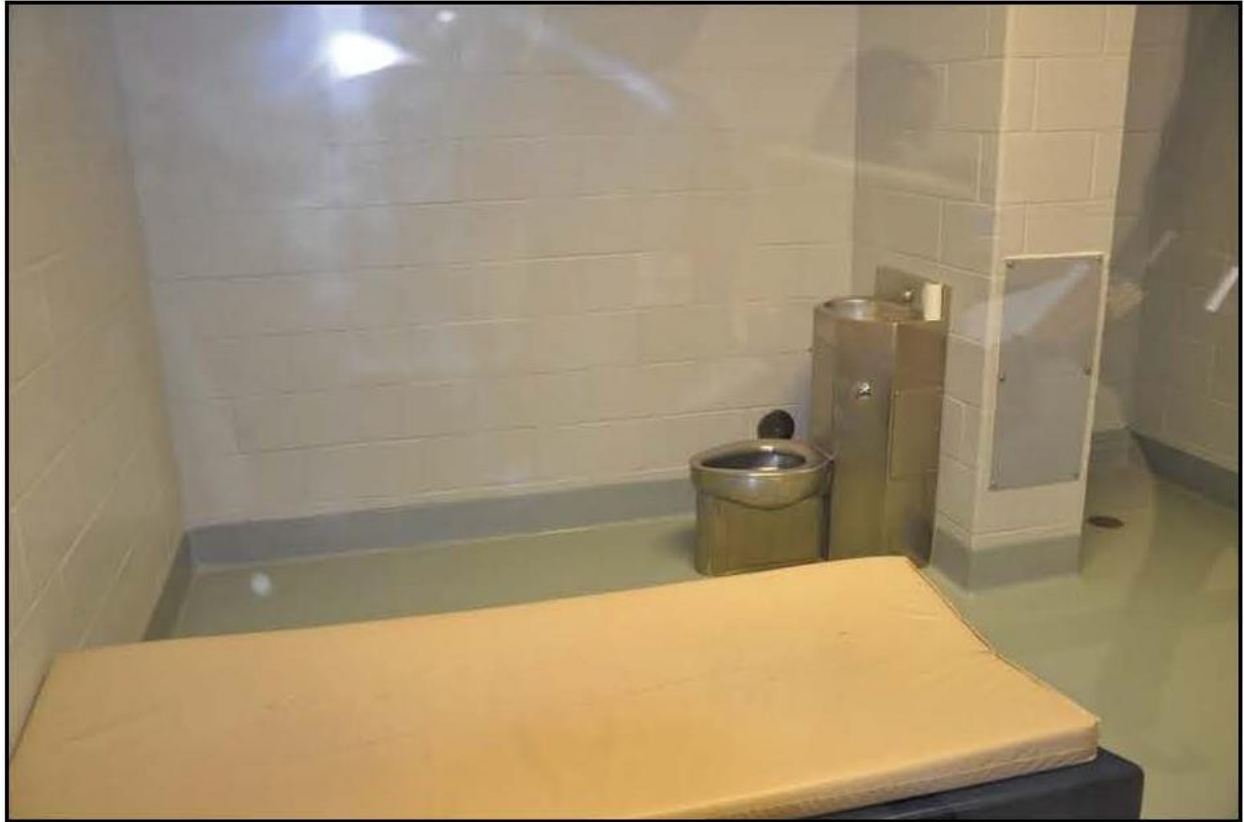
Suicide Observation Cell (Adelanto West Facility)

Beyond the reliance on suicide watch cells, GEO Group's response to detainees in acute mental health crisis can be violent or punitive, lacking in appropriate therapeutic intervention, and ultimately psychologically damaging.