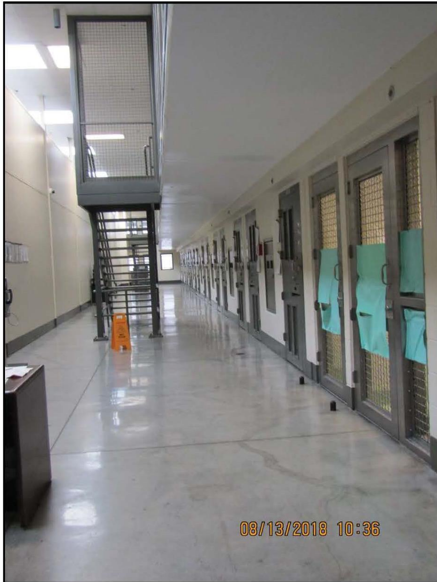
Men's Disciplinary Segregation Unit (Adelanto West Facility)

We found that serious delays and gaps in the provision of medical care at Adelanto are a pervasive problem, and that they disproportionately – though not exclusively – harm people with disabilities. Denials of medical care have in many cases also caused or exacerbated a person's psychiatric distress.