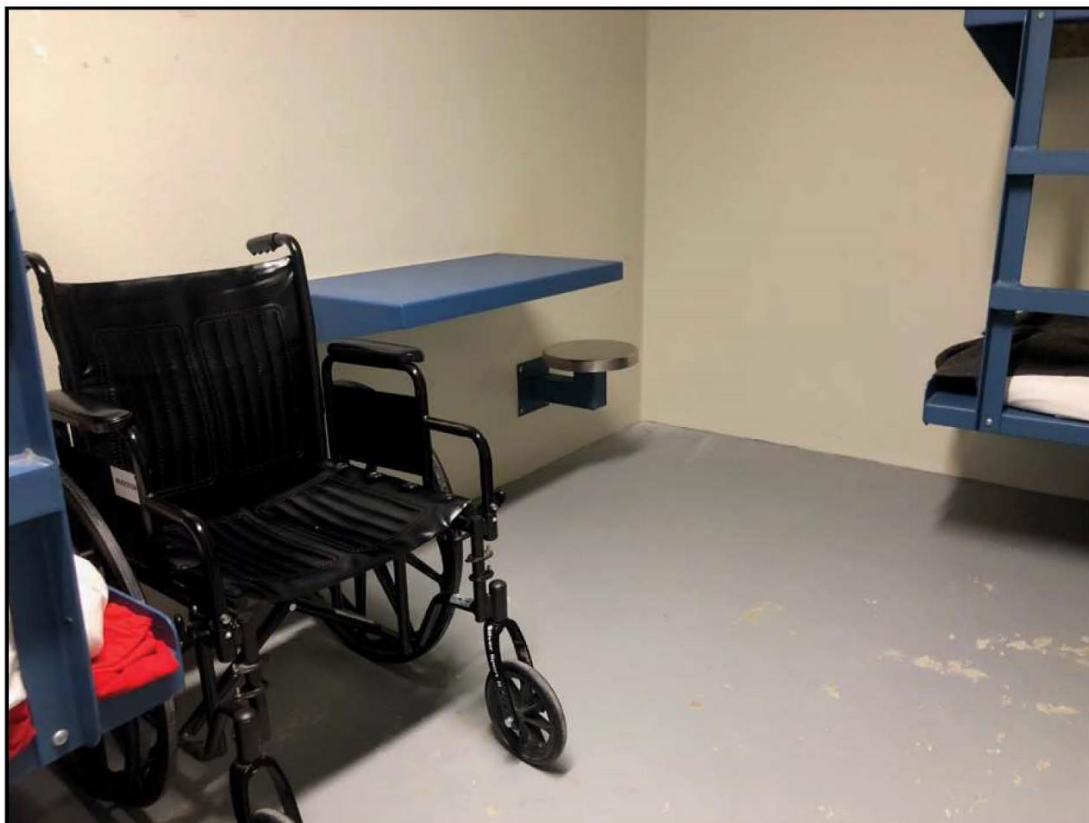
Men's Disciplinary Segregation Unit Cell with Wheelchair (Adelanto West Facility)

Under Section 504 of the Rehabilitation Act of 1973, DHS and ICE are prohibited from discriminating against people with disabilities. In addition, DHS has adopted a regulation guaranteeing that “[n]o qualified individual with a disability in the United States, shall, by reason of his or her disability, be excluded from the participation in, be denied benefits of, or otherwise be subjected to discrimination under any program or activity conducted by the Department [of Homeland Security].” 68 People with disabilities in immigration detention facilities like Adelanto have legal rights to equal access to programs, activities, and services, and to reasonable accommodations and modifications as necessary to ensure such equal access. It is the responsibility of DHS, ICE and their contractors – GEO Group and the City of Adelanto – to ensure against disability discrimination at the Adelanto Detention Center. 69 California State disability law also applies to the treatment of individuals with disabilities who are detained in this privately operated facility. 70