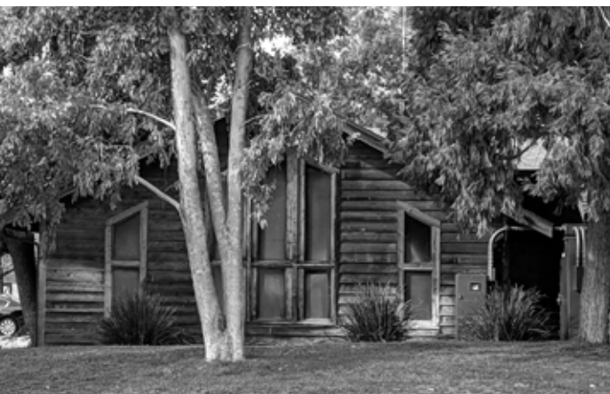
BCFS staff secure facility in Fairfield, CA

BCFS in Fairfield is the only staff-secure facility in California currently contracting with ORR to detain immigrant children. It has a capacity for 18 children ages 12 to 18 years. BCFS houses only male children. The BCFS building is a modern, recently-renovated building with an artificial turf back field and trailers that serve as classrooms. Whatever educational services BCFS provides are independent of the local school district.