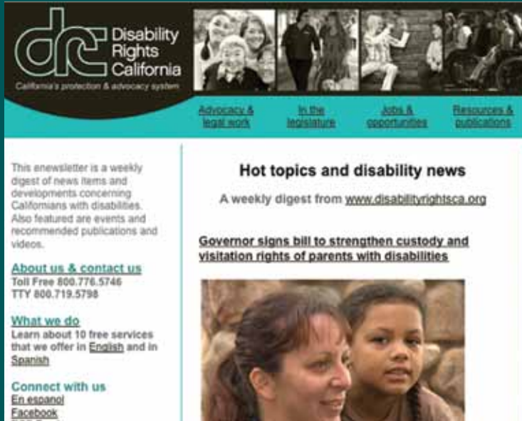
Weekly newsletter launched 2010