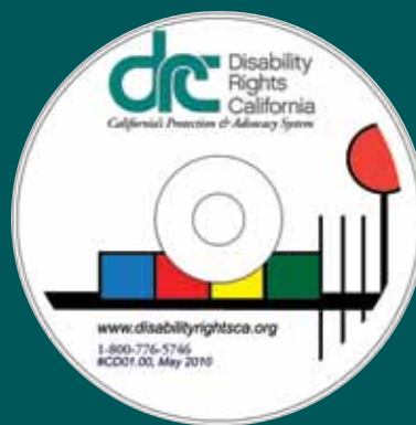
Most popular publications CD