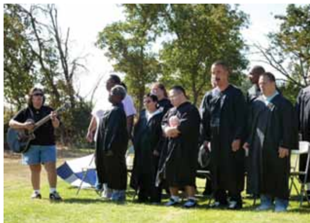
Stockton ceremony.

On September 20, about 100 people gathered for the twilight ceremony to remember people who died at Camarillo State Hospital, 1936-1997. The former hospital is now part of the California State University, Channel Islands campus and this was the first time a Remembrance Ceremony was held there. Ceremonies were held simultaneously at 9 sites of current or former state institutions for people with developmental or psychiatric disabilities.