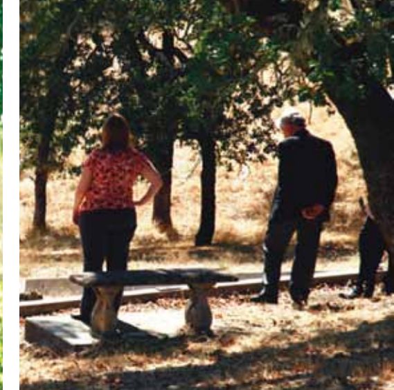
2009 ceremony at Sonoma Developmental Center

For people who lived much of their lives locked away in state hospitals or forgotten in developmental centers, perhaps the ultimate indignity was to be buried anonymously. In their honor, the California Memorial Project, founded and run by advocates with developmental or psychiatric disabilities, works to create permanent monuments at the burial sites and organizes Remembrance Day every fall. On September 21, over